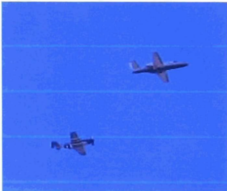
Patten-Reese Heritage Flight