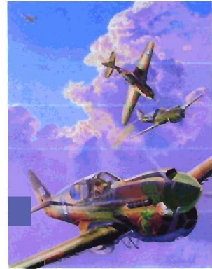
& Incident at Humpty Doo