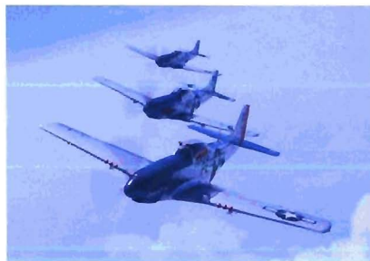
Cripes, Sweetie Face & Moonbeam