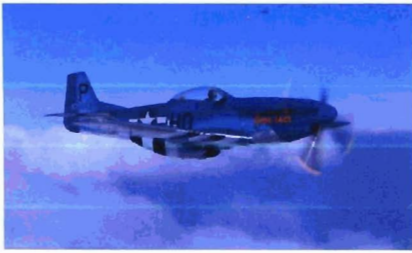
Tom Patten & Sweetie Face