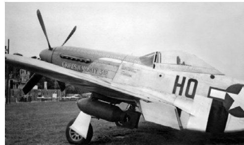
Cripes A'Mighty 3 rd ; new photo by Sam Sox.