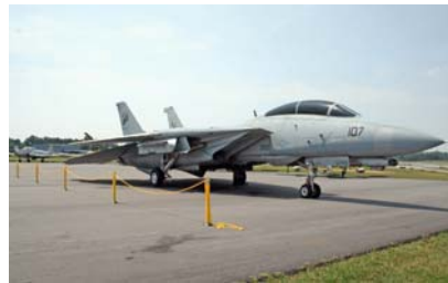
Hickory Aviation Museum