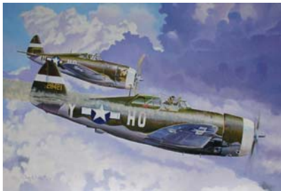
Bail Out by Troy White