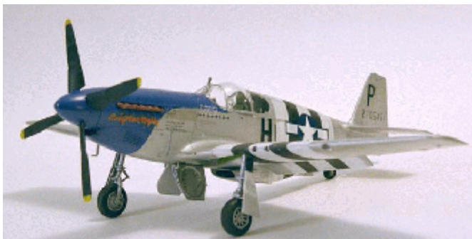
Cripes A'Mighty 2nd